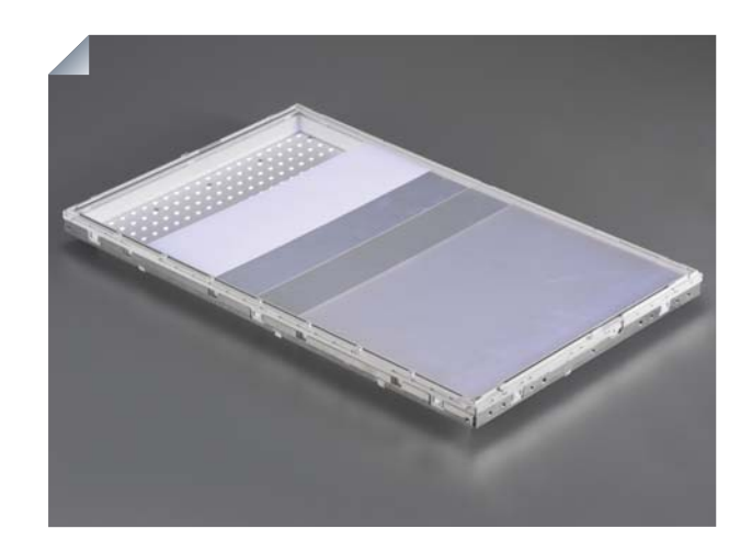
LED of direct type